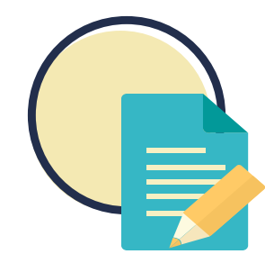
Step 2: Write an essay (no more than 500 words) describing how your background and experiences have led you to appreciate the difficulties faced by the medically underserved.